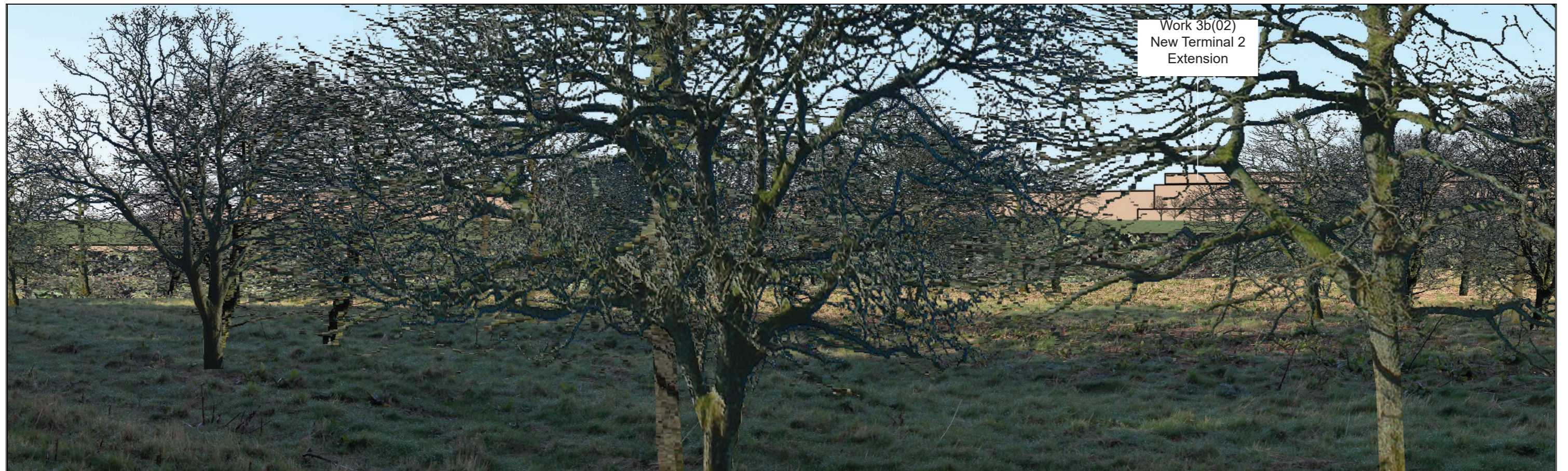
View with proposed planting (Phase 2b)