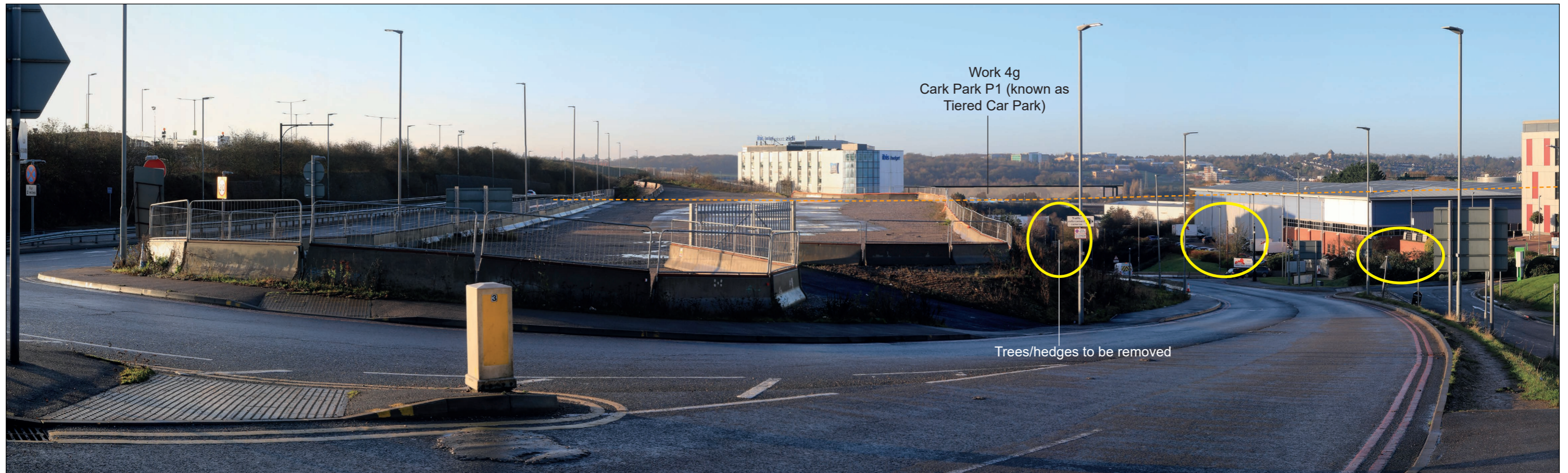
Block Form of Max. Parameters (Viewing Distance 300mm)