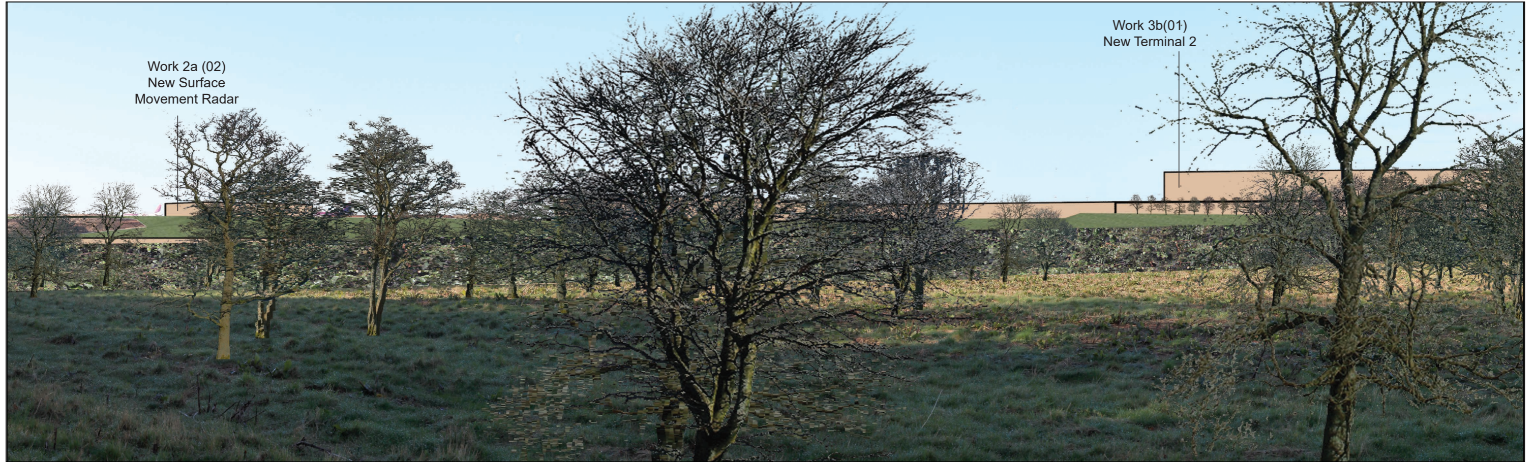
View with proposed planting (Phase 2a)

Accurate Visual Representation based on winter viewpoint photography. Refer to Appendix 14.6 of this ES [TR020001/APP/5.02] for corresponding viewpoint information.