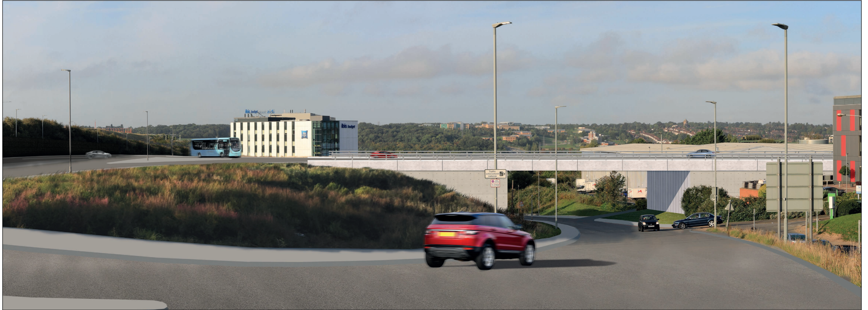
Illustrative photomontage of new Airport Access Road and bridge over Airport Way

Accurate Visual Representation based on winter viewpoint photography. Refer to Appendix 14.6 of this ES [TR020001/APP/5.02] for corresponding viewpoint information.